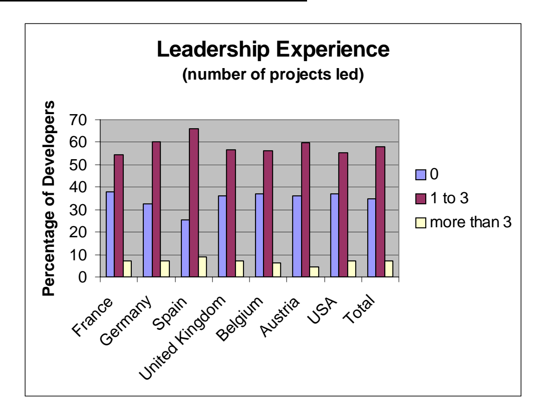
Figure 4: Leadership experience of developers